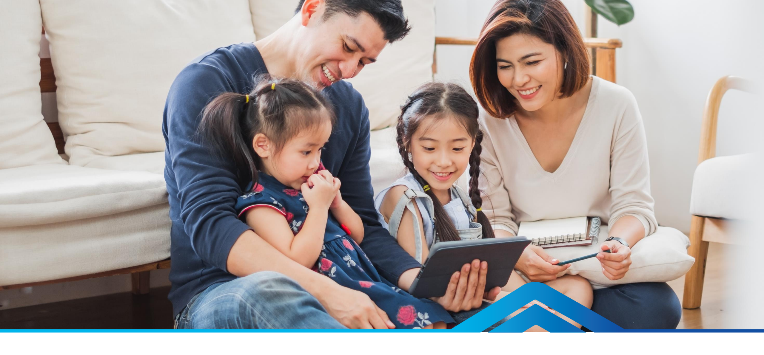
Washoe Behavioral Health Policy Board Meeting January 10, 2022